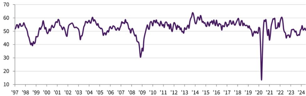
East Midlands Business Activity Index sa, >50 = growth since previous month