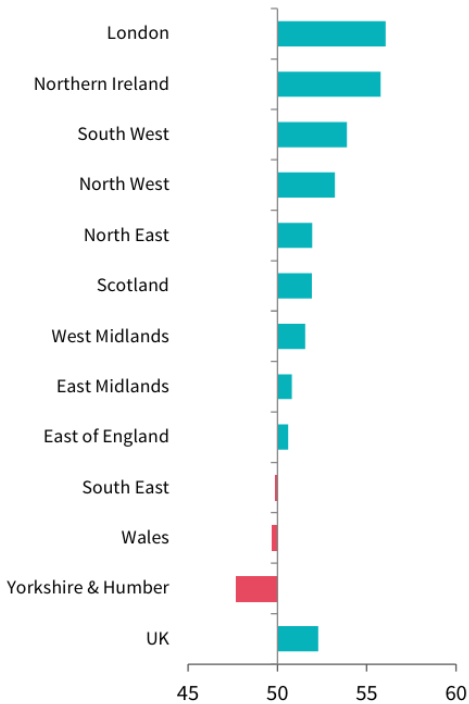
Business Activity Index sa, >50 = growth since previous month, Jun '24