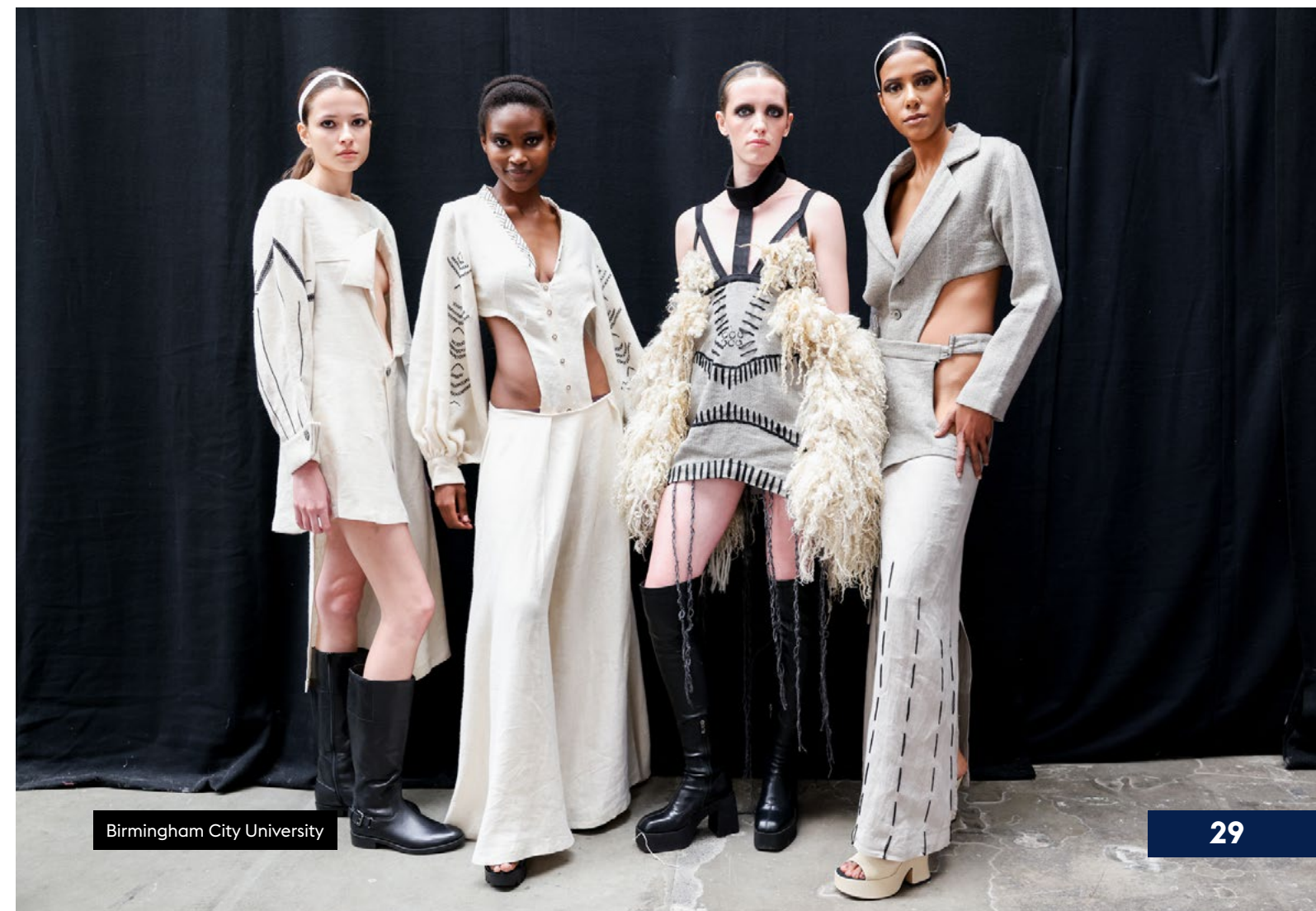
Birmingham City University

Research by Loughborough University Environmental Ergonomics Research Centre in partnership with adidas developed the first-ever sweat body maps of males, females, and children to inform the company's sector-leading clima® product range. These body maps are now widely used as a benchmark for thermal comfort, informing product innovation in technical textiles in the global sports industry. The knowledge is integrated into the world's first virtual Human Thermal Model which enables organisations worldwide to optimise product design for multiple populations across a range of industry sectors.