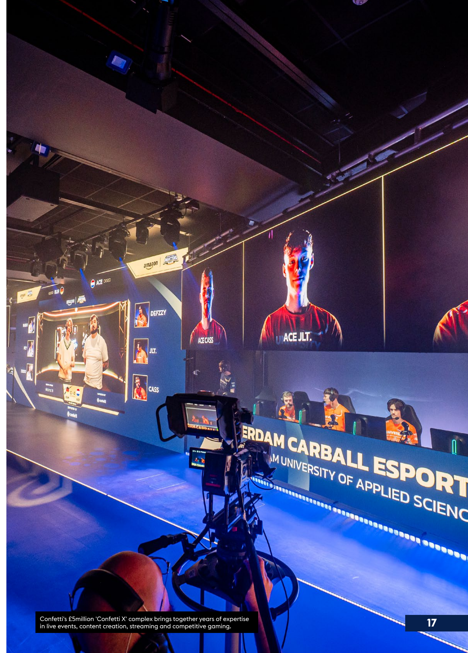
Confetti's £5million 'Confetti X' complex brings together years of expertise in live events, content creation, streaming and competitive gaming.