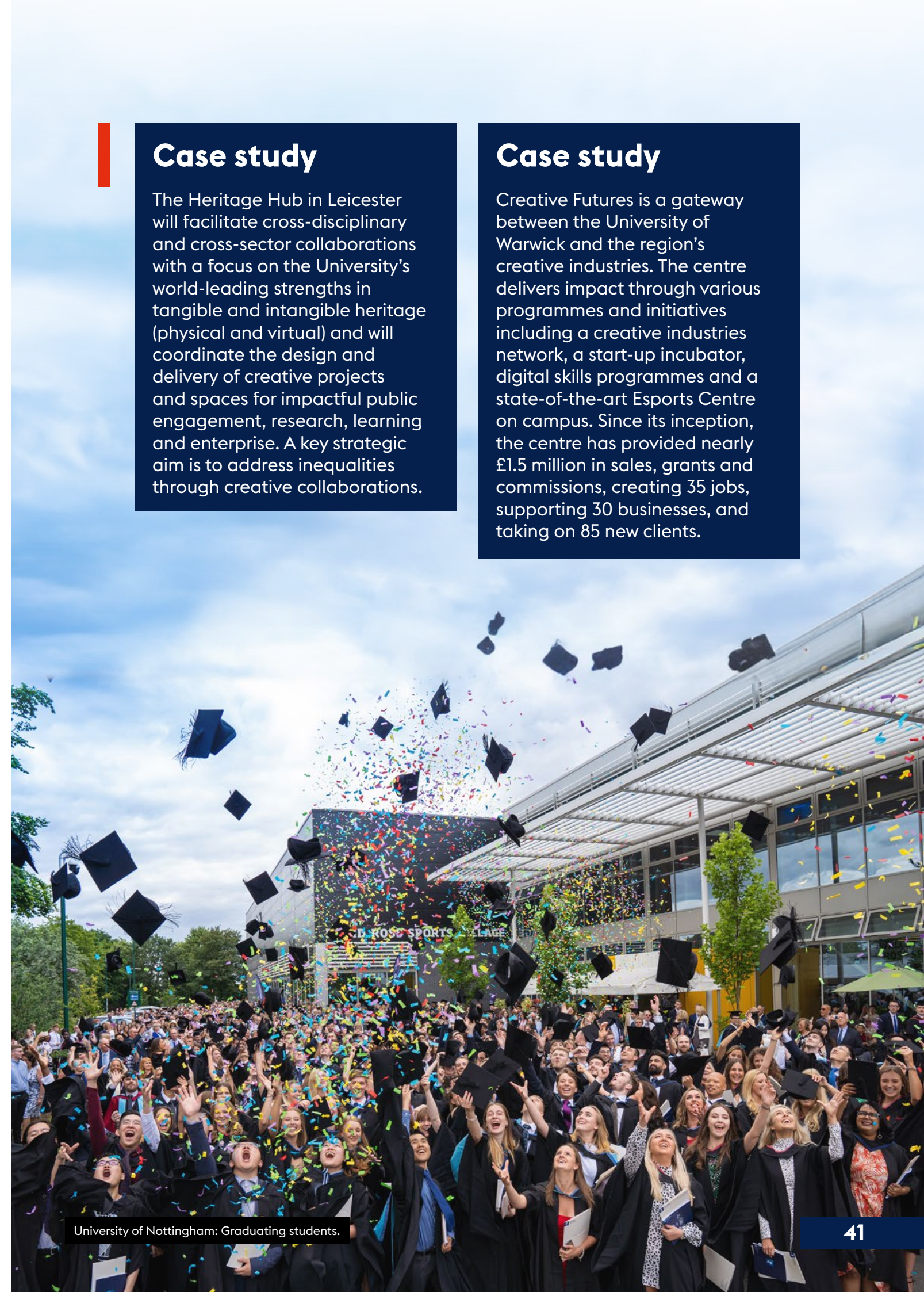
University of Nottingham: Graduating students.

Creative Futures is a gateway between the University of Warwick and the region's creative industries. The centre delivers impact through various programmes and initiatives including a creative industries network, a start-up incubator, digital skills programmes and a state-of-the-art Esports Centre on campus. Since its inception, the centre has provided nearly £1.5 million in sales, grants and commissions, creating 35 jobs, supporting 30 businesses, and taking on 85 new clients.