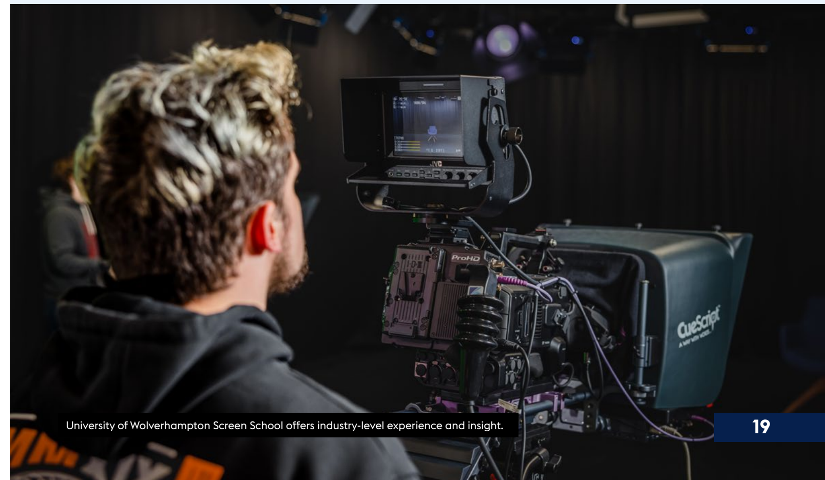
University of Wolverhampton Screen School offers industry-level experience and insight.

Film Birmingham is an initiative of Create Birmingham and serves as the film commission for the Greater Birmingham region. It acts as the primary liaison between film production and city agencies. Its primary mission is to create job opportunities, generate revenues, elevate regional visibility, and advocate economic development within the Greater Birmingham region. The office will assist productions with the permitting process, connect parties with local crew and resources, and facilitate communication between productions, the municipalities, and the community.