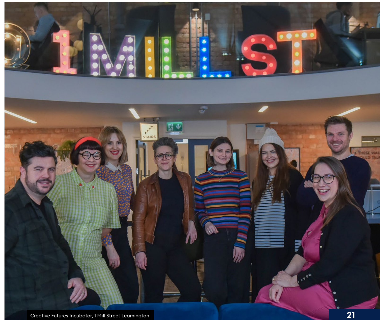
Creative Futures Incubator, 1 Mill Street Leamington