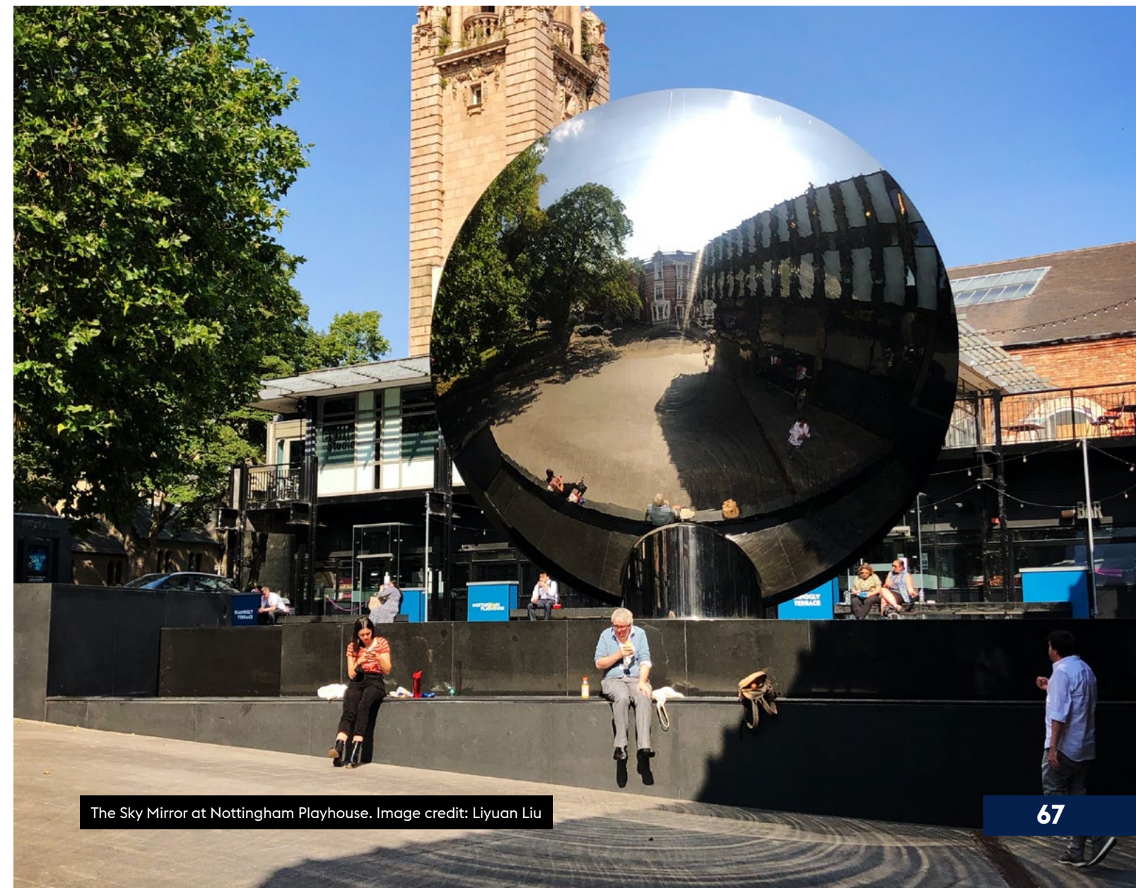
The Sky Mirror at Nottingham Playhouse.