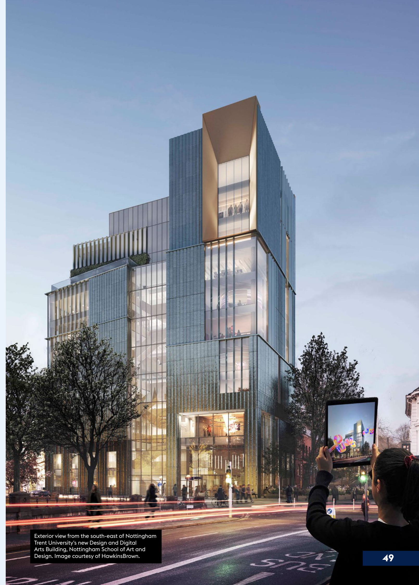
Exterior view from the south-east of Nottingham Trent University's new Design and Digital Arts Building, Nottingham School of Art and Design.

• Contact: paul.herriotts@coventry.ac.uk