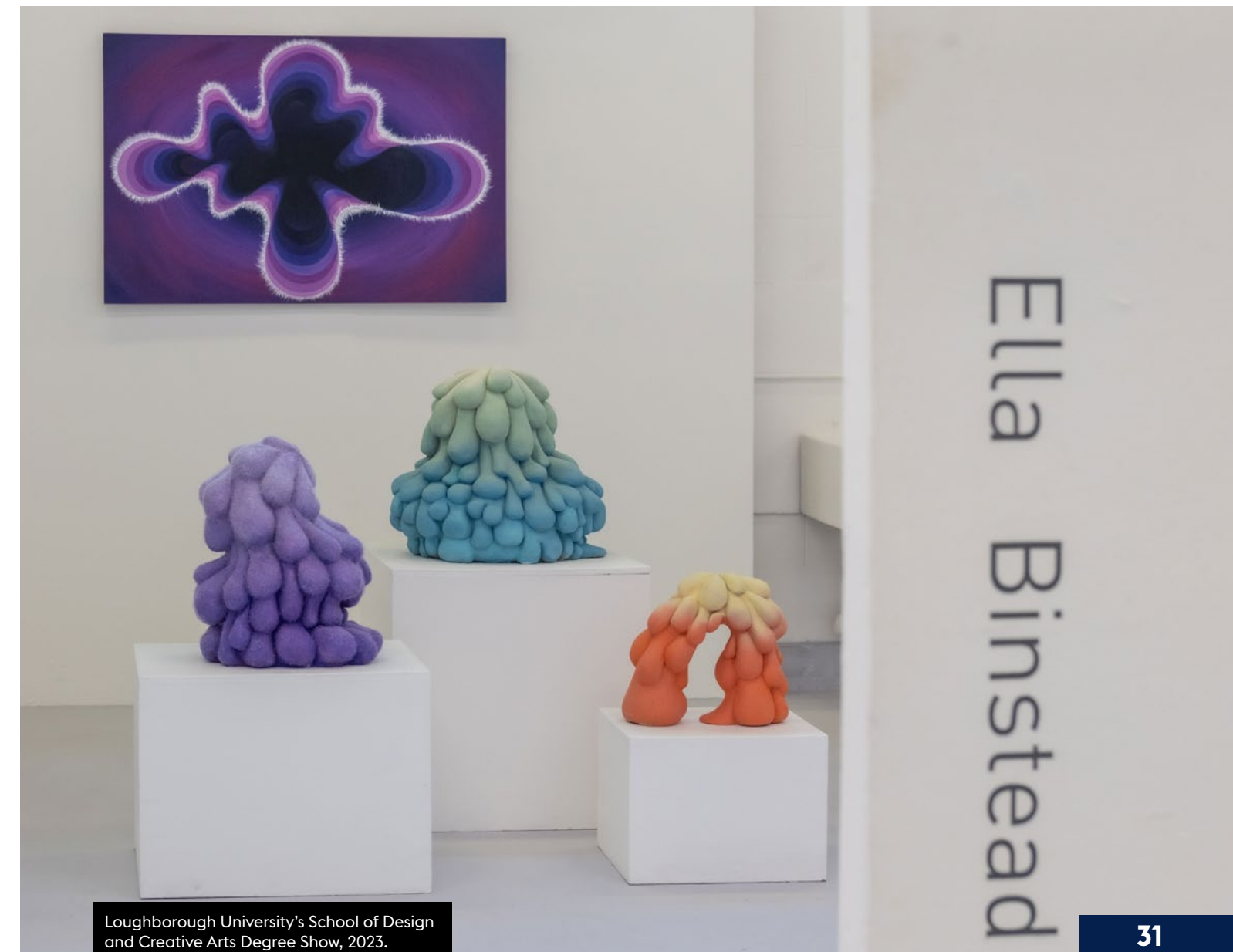
Loughborough University's School of Design and Creative Arts Degree Show, 2023.