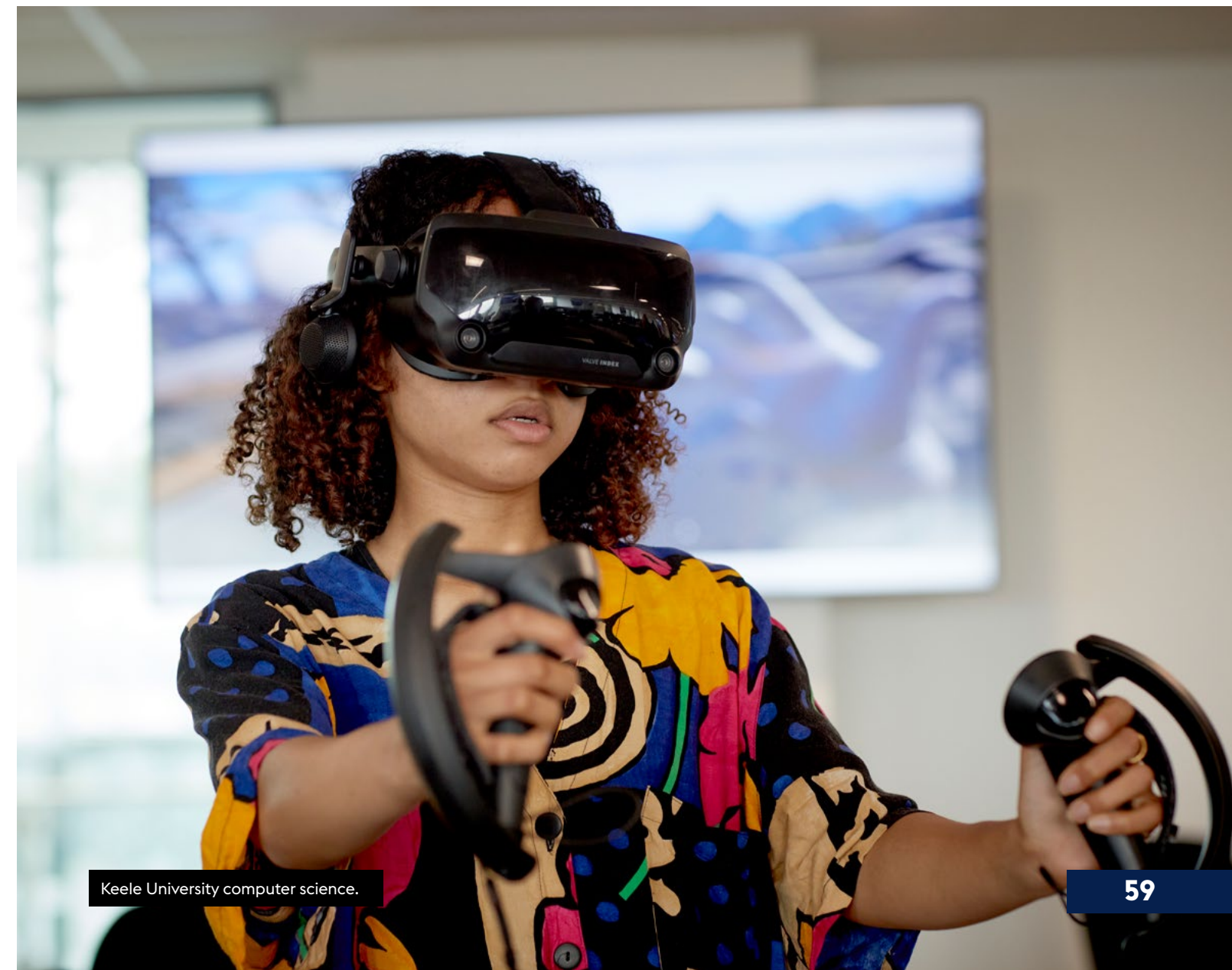
Keele University computer science.